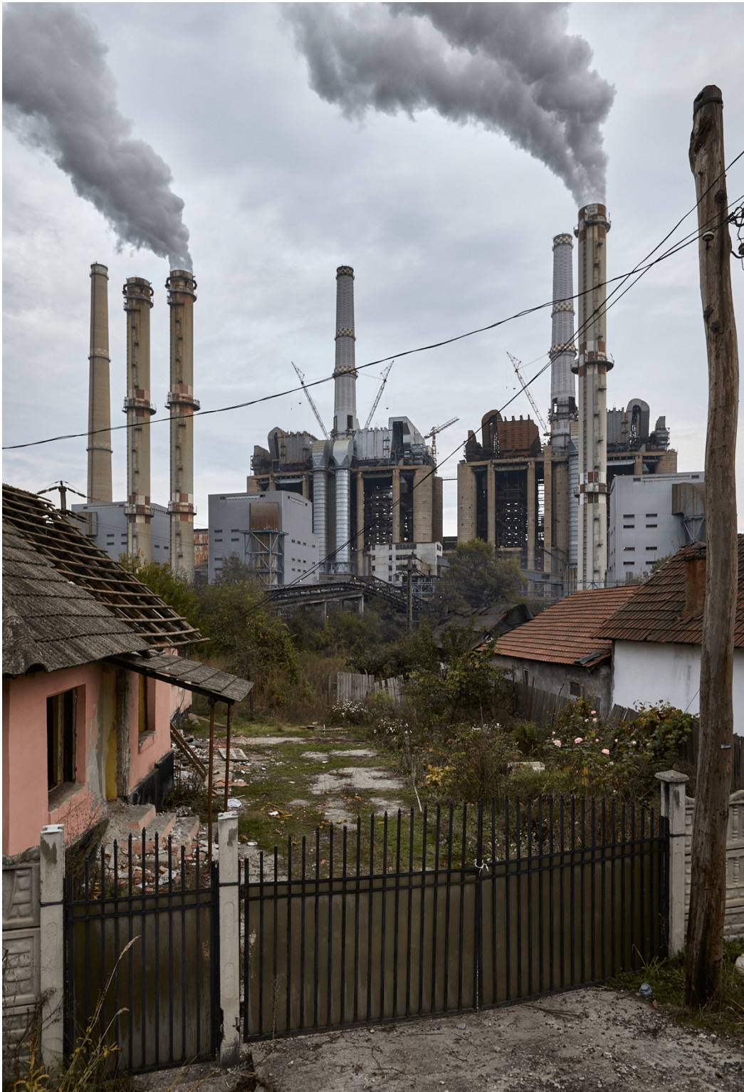
Rovinari Power Plant, Romania / Photo by: Mihai Stoica/Bankwatch