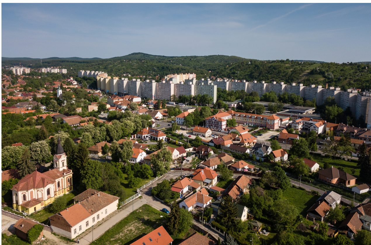
Miskolc city, Hungary.