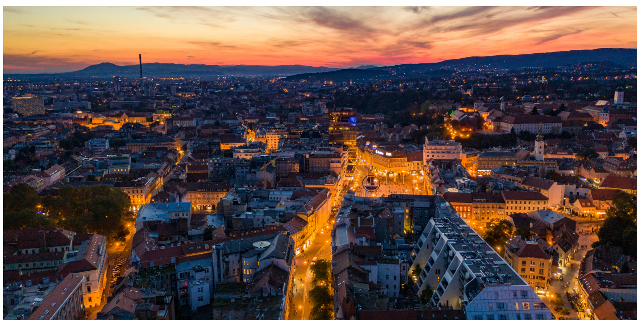
Zagreb, Croatia.

In a project financed by Horizon 2020 which began in 2018 and finished in 2020, "Keep Warm," pre-feasibility studies were developed for the integration of solar fields in Velika Gorica, Zaprešić, and Samobor, all of which are towns close to Zagreb. As a follow up to these studies, another project, 'City Storage and Sector Coupling Lab,' financed by the ERDF, will turn these sites into demonstration sites to be used for capacity building throughout the region 21 .