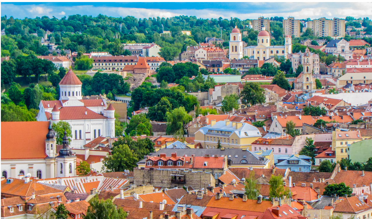
Vilnius, Lithuania.

In order to do this, the network needs to be modernised to be able to incorporate lower temperature renewables as most of the current network still requires high temperatures and there are significant heat losses. With a EUR 43 million investment from the European Investment Bank, the company has begun to upgrade its system to reduce heat losses and optimise the heat supply to consumers. Additionally, in 2021, Lithuania obtained EUR 20 million from the Modernisation Fund for investments into building insulation in the 2022-2027 period. The objectives of the scheme are to improve energy efficiency and reduce greenhouse gas emissions through the renovation of public buildings owned by municipalities.